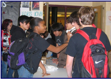
Einstein H.S. SOS Club peer outreach for Great American Smoke Out