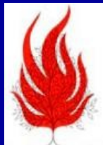
Community Ministries of Rockville