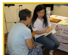
AAHI Health Promoter at an outreach event.